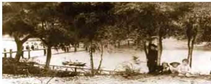
Sunday afternoon in Bluffton, c. 1900

Although the overall destruction was severe, 15 houses and two churches survived, including the c. 1840 Heyward House. By the turn of the century, the town again experienced growth with the opening of several hardware and dry-goods stores and the growth of a burgeoning oyster-harvesting business. Lowcountry residents returned to Bluffton, a place many continued to call home for the summer. The 1922 construction of the Houlihan Bridge from Port Wentworth SC Highway 17 ended commercial trade by water several years later. The shift away from being a center of trade ushered in a new phase of Bluffton development, where again it became predominantly a summer getaway. In 1996, the Town was designated a National Register Historic District. Over the past 50 years, it has attracted many full-time residents due to the livable, desirable historic character of Old Town.