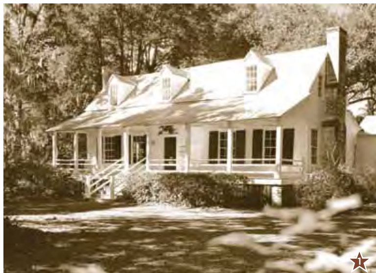
Your starting point — The historic Heyward House