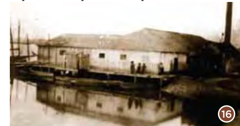
Bluffton Oyster Factory, c. 1900

This oyster-processing and seafood business represents an important industry in both Bluffton and the Lowcountry. The current building was constructed c. 1940 on the same site as previous oyster factories and is one of the last oyster factories on the east Coast. The Bluffton Oyster Co. is one of South Carolina's top-10 oldest, continuously operating businesses, and is the oldest cannery factory still in operation in the state. Beaufort County purchased the land surrounding the factory for preservation of open space and development of a passive use park.