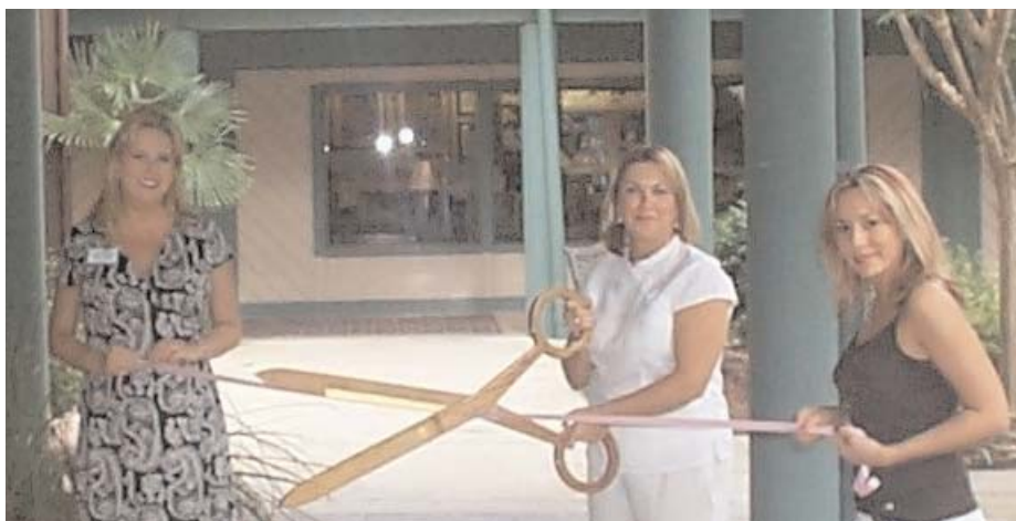
Ribbon cutting for the grand re-opening of Merle Norman Cosmetics in Pineland Station on Hilton Head Island.